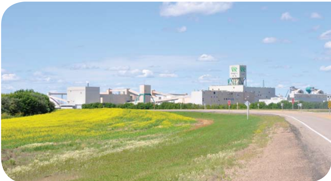
Potash mine near Saskatoon.

Water is an essential resource in the potash mining process. Potash mines in the Qu’Appelle River Watershed get their water from three sources: the Qu’Appelle River system itself (which includes the Buffalo Pound Lake reservoir), groundwater, or from Lake Diefenbaker via the Saskatoon South East Water Supply System (SSEWS). This case study research focuses on mines that do not source their water from the SSEWS, since the SSEWS is connected to the South Saskatchewan River Basin and is considered to be a different system in terms of water management. There are eight potash projects in the Qu’Appelle River Watershed that do not source their water from the SSEWS - four producing mines and four non-producing mines at various stages of development (Figure 2). Of these eight mines, six are covered in the interview sample (see Methods section).